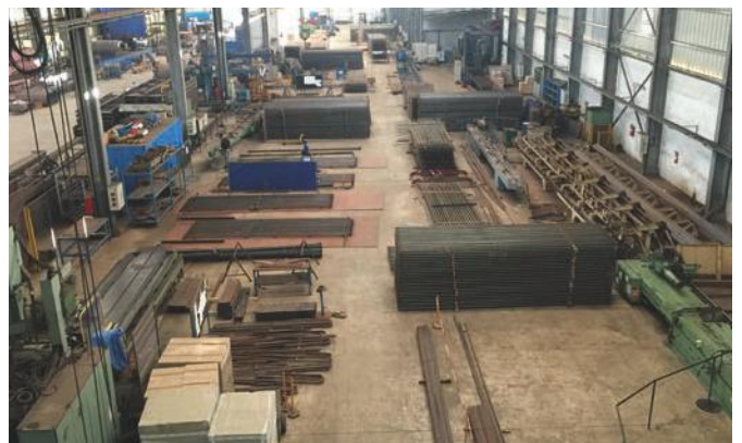
Workshop: tube shaping and assembly works, machining