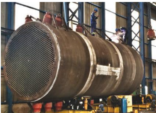
Production of a 1,200-tube heat recovery boiler