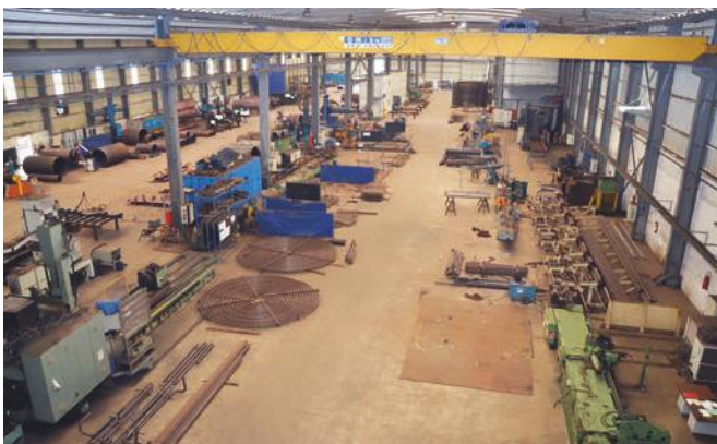
Workshop length: 120 m