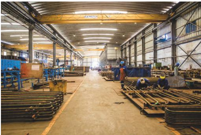
Headroom (to crane hook): 9 m – Width: 2x25 m 8 overhead cranes