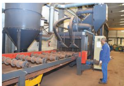
Tube shot-blasting station