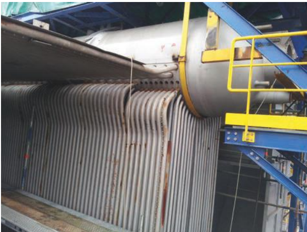
Installation of a new Babcock boiler (steam output: 110 t/h), five months of works by 45 workers in Cameroon