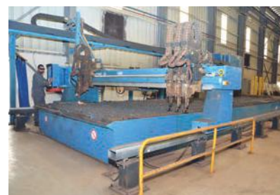
Multi-head oxycutting unit

Welding Bending Rolling Machining Assembly