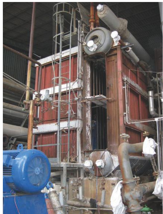
Complete renovation of a 50 t/h, 70 bar water-tube boiler