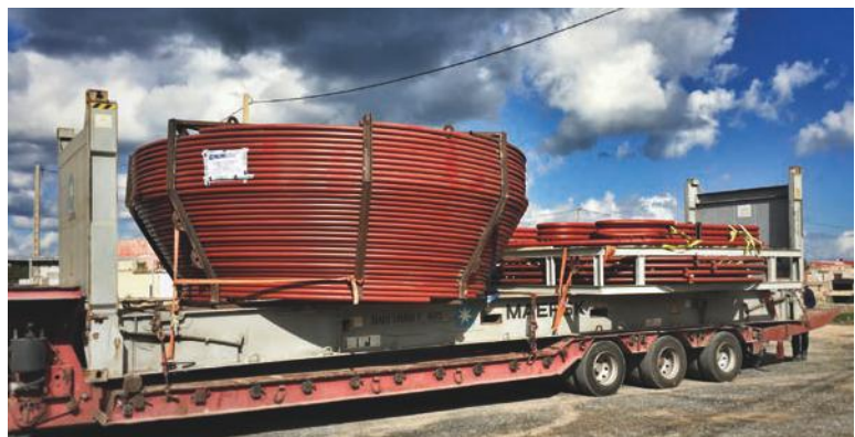
Construction of a superheating evaporator for a nitric acid boiler