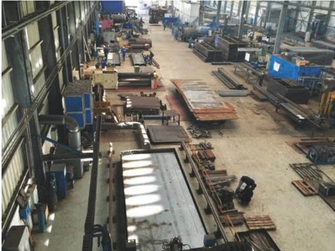
Workshop: steel platework, shaping, equipment assembly and finishing, welding jig machining