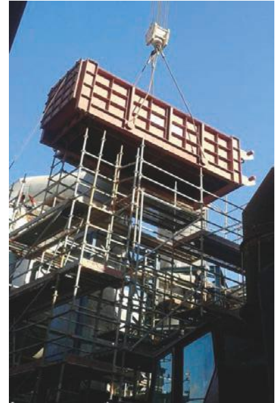
Replacement of an economiser unit at a sulphuric acid plant