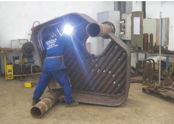
Fabricating a water screen for a fire-tube boiler