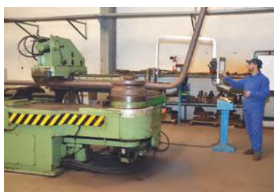
CNC tube bending machine