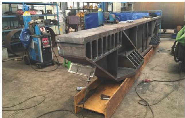
Steel platework and fabricated parts