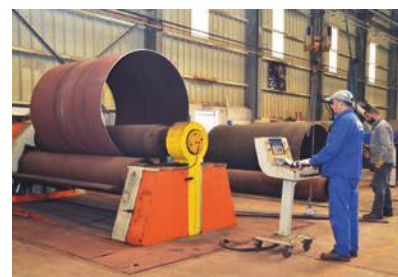
Sheet rolling machine