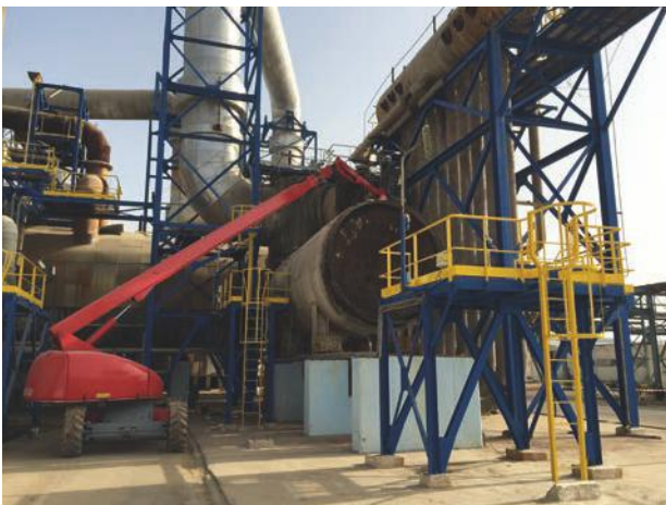
Manufacture and replacement of a 120 t heat recovery boiler for OCP in Morocco