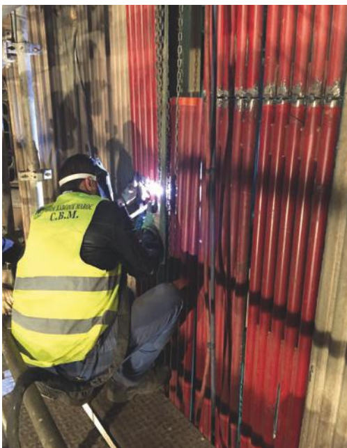
Replacing a boiler screen at a thermal power plant in Morocco